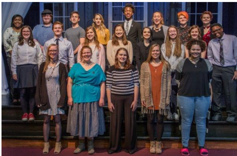
Contestants in the Central Illinois Regional Contest, Poetry Out Loud.