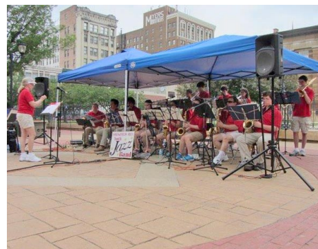
The Springfield Area Youth Jazz Band performs at this summer's Artist On the Plaza series. Join them December 4 at the Hoogland Center for a holiday special event!

It's sure to put you in the Holiday mood. Please come!