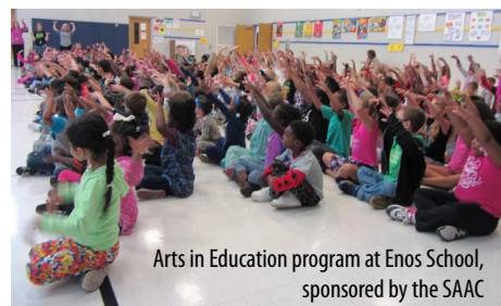
Arts in Education program at Enos School, sponsored by the SAAC

The Springfield Area Arts Council enriches the community by promoting and supporting all art forms and providing creative opportunities to participate in and enjoy the arts.