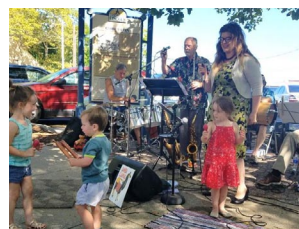
Dancing to the music