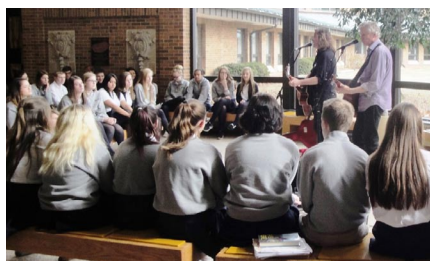
Switchback at Sacred Heart-Griffin High School